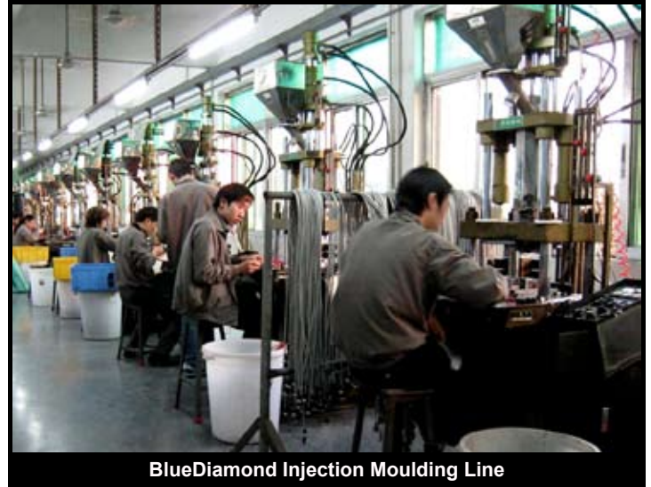
BlueDiamond Injection Moulding Line

BlueDiamond Cables follow rigorous testing and are all 100% approved with applicable safety regulations. Our quality control procedures ensure the highest possible quality level is maintained during production. Quality and proper electrical characteristics again verified during secondary inspection upon arrival in Canada. Our cables are made from 100% copper conductors and never "copper clad aluminum", which can be the mark of inferior cable brands.