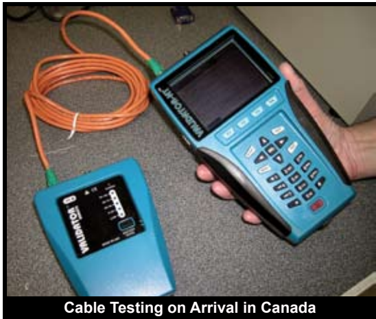
Cable Testing on Arrival in Canada

We strive to supply the highest quality cable so that our customers can feel confident in the ability of BlueDiamond product to hold up to even the harshest operating environments. This is backed by our Guaranteed Lifetime Warranty on all our cables and adapters.